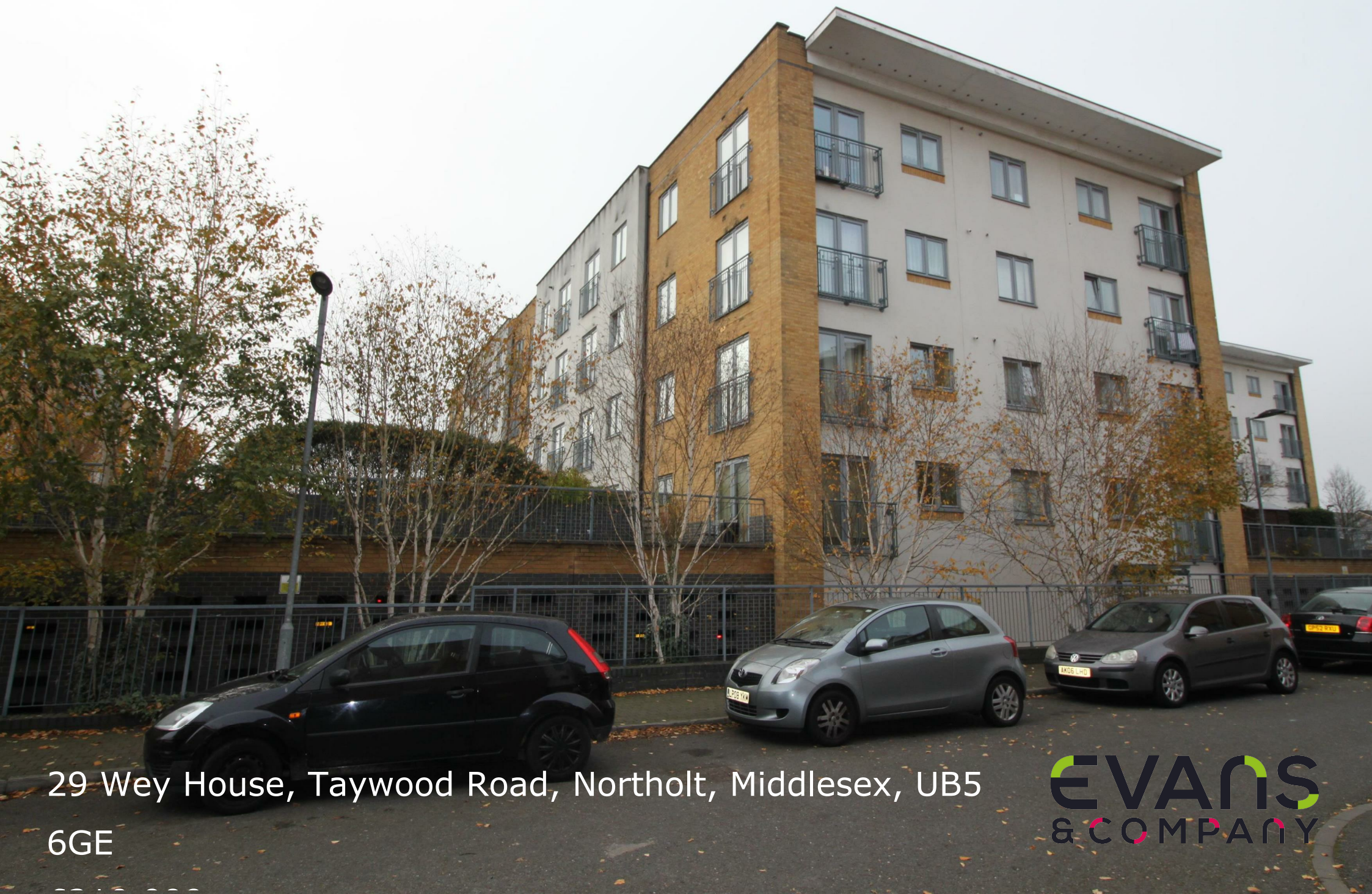
29 Wey House, Taywood Road, Northolt, Middlesex, UB5 6GE